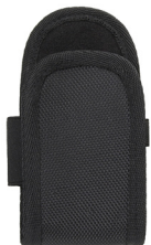
A41014-7 Universal Safety Knife Fabric Holster